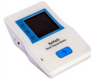
ReMeDi® - NOVA Blood Pressure