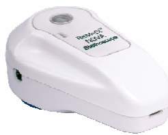
ReMeDi® - NOVA Electronic Stethoscope