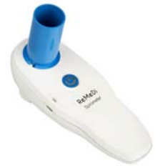
ReMeDi® - NOVA Spirometer