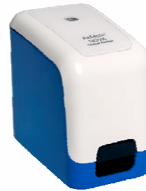
ReMeDi® - NOVA Optical Reader

Neurosynaptic also provides a range of other integrated sensors from partners. These include several blood & urine chemistry tests, and scopes which enables up to 35 different point of care tests.