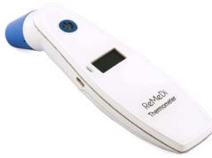
ReMeDi® - NOVA Ear Thermometer