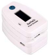
ReMeDi® - NOVA Pulse Oximeter