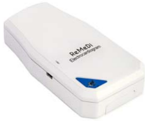
ReMeDi® - NOVA 12 Channel ECG

Neurosynaptic introduces ReMeDi® - NOVA Diagnostic Solution that is perfectly suitable for the Point-of-Care services. The Low Energy Bluetooth enabled Kit provides a powerful interface to work with Computers, Mobile Phones and Tablets with equal ease. Extreme power efficiency ensures usage for several days after charging, and the Patented "Safe Devices" interface provides unique controllability and usage tracking, avoiding Human Errors.